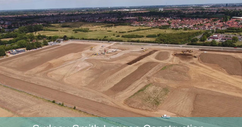
Sydney Smith Lagoon Construction