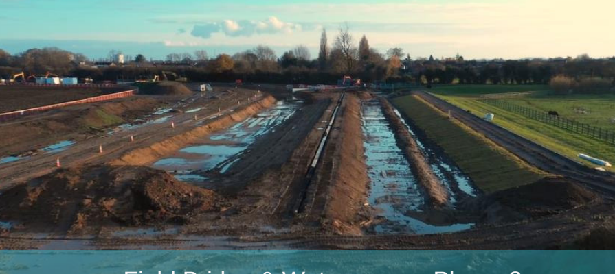
Field Bridge & Watercourse Phase 2