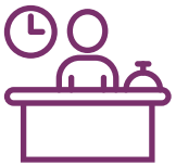
Entry Level: Receptionist

There is a range of different level roles within the legal sector such as: