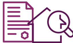
Mid - High: Licensed Conveyancer