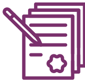
Entry - Mid: Paralegal